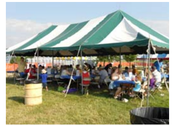
PancakeFest patrons enjoying all you can eat pancakes.