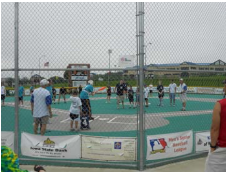
Above: Team sponsor signs are placed around the field for the duration of the season.

Act today! Download the 2011 Team Sponsor brochure from the KML web site, provide the necessary information, and mail your check. You WILL be making a difference!